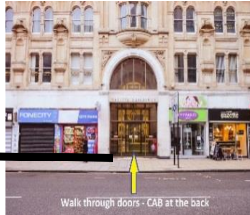
Walk through doors - CAB at the back