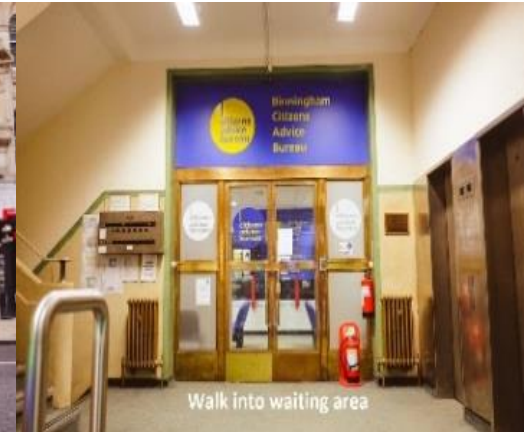
Walk into waiting area

Opening Times: (from 5/6/2017) To book appointment contact: